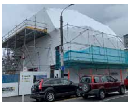
The shroud of secrecy.