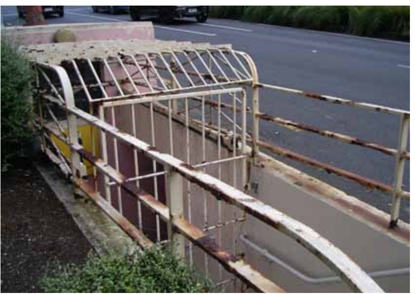
Wellesley St toilets before and (below) after rust was removed and the above-ground structure repainted.

Audrey's mother remembers these toilets used to be a pleasant refuge from the city 4