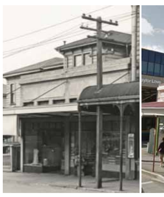
The old building at 287 Cuba St.