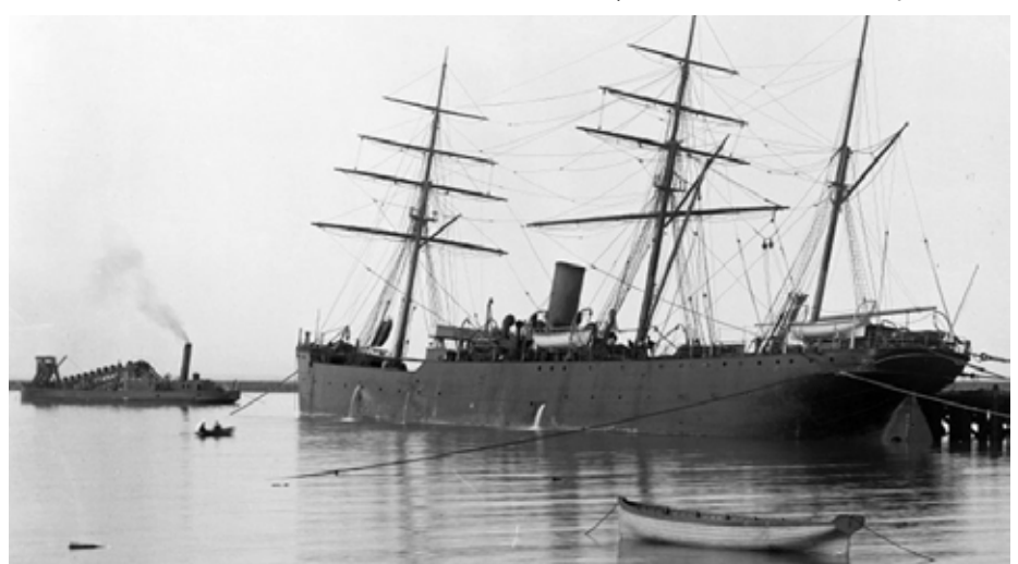
The Elderslie moored at Oamaru. Note its masts and also the bucket dredge in the background, which played an important part in the development of the new wharf.

The Dunedin, with the first shipment of about 5000 carcases in its freezers, sailed from Port Chalmers on 15 February 1882. Despite the ship being becalmed during the voyage, the frozen meat arrived in London 98 days later in good condition and a new industry was born. The first shipment