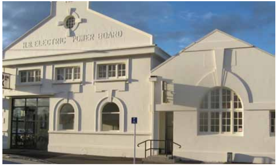
Hawke's Bay Electric Power Board building, Hastings, and (below) engine room after 1925 showing all six generating units in place with three cylinder engines in the foreground.

Power was initially supplied via direct current. Increasing demand required extra generating plant including two alternating current generators together with extensions to the building. By 1925 there were six generating units in operation with a total output of 1,087kW, being 567 kW DC and 520 kW AC. Production cost of electricity