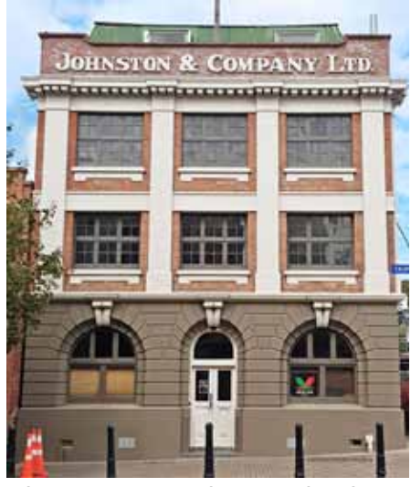
Johnston & Co. (1914), Whanganui. The only surviving reminder of one of the most important colonial mercantile houses and of the Whanganui hub of commerce and mercantile activities.

They represent a complete and significant number of building styles dating between 1860 and 1960. There are also a large number of Māori sites of significance including the St Paul's Memorial Church, Putiki which was awarded NZ Heritage Category 1 status, and numerous marae along the Whanganui River Road to the