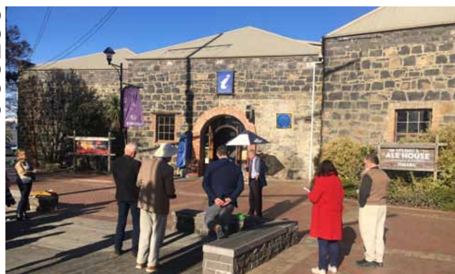
Unveiling ceremony for the Blue Plaque on the Timaru Landing Service building, erected in 1870 along the original shoreline of Timaru harbour.