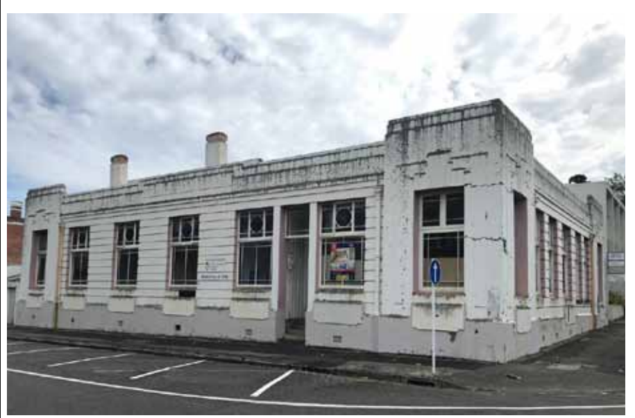
Ripe for restoration – the 1922 Native Land Court in Whanganui's city centre.

Award entries close on Monday 31 August.