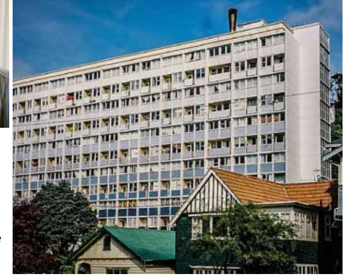
The Gordon Wilson Flats.

The destruction this year of the building's Auckland 'twin' (the Upper Greys Avenue Flats) has increased the heritage values of the Gordon Wilson Flats. It is now the sole example of