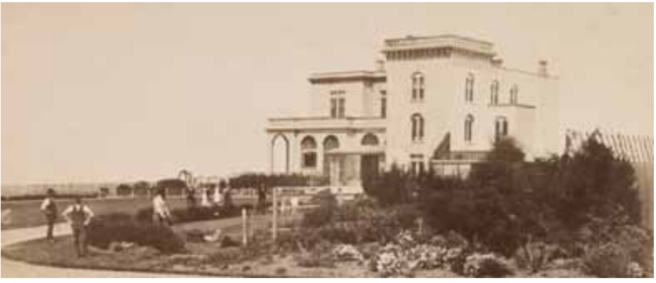
Dunedin's other castle, Cargill's Castle, then and now.

Stage 2: internal strengthening and steel walkway framing to enable people to walk through the building