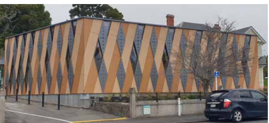
Ngāti Te Whiti will launch Heritage Taranaki's Heritage Month at Te Whare Hononga, Taranaki Cathedral (above).