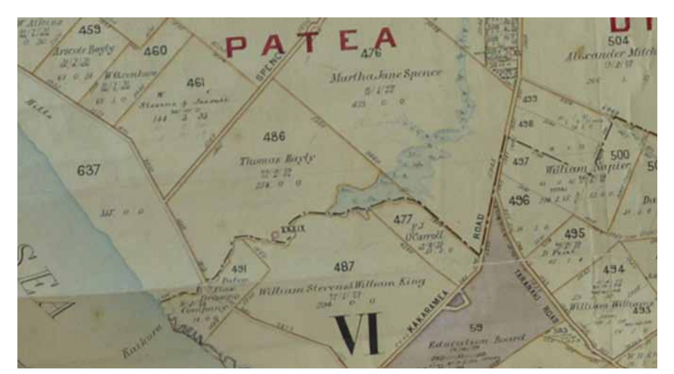
Location of Pātea Flax Company on the coast, 1870 – lower left corner of map, section 491.