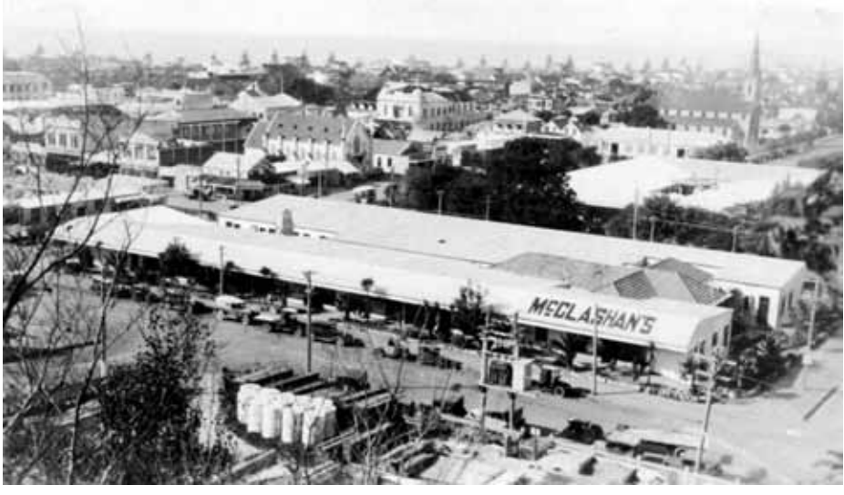
Tin Town showing McGlashan's Auctioneers; St Patrick's Church, Trinity Methodist Church and trees on perimeters of Clive and Memorial Squares.

An existing description of the work to be undertaken in the 'reconditioning' of the Women's Rest indicates it was