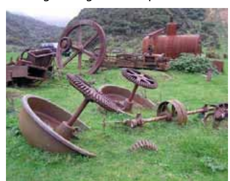
Berdans at Albion Battery.