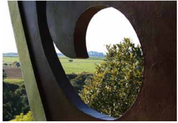
View through the Rangi Hiroa (Peter Buck) Memorial over surrounding Urenui landscape.

The month's activities drew to a close at Taranaki Cathedral Church of St Mary – Mere Tapu with a church service on