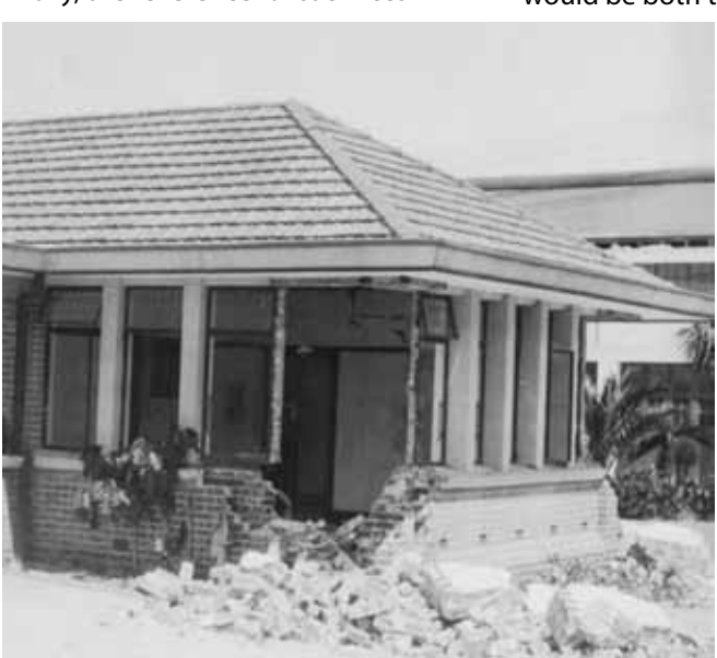
Women's Rest after the Hawke's Bay earthquake on 3 February 1931 from the Tennyson Street side of Memorial Square. The building was badly damaged by the earthquake.

After World War 1 (and amid the Influenza pandemic), there was a great outpouring of public grief and pride throughout New Zealand with calls to build monuments and memorials. But many ambivalent feelings about the War and the sacrifices people had made prevailed. At the Cenotaph's unveiling in 1924, a newspaper reporter identified some of these feelings as bitterness, sorrow, pride, the joy of winning, and finally, the reverence for sacrifices