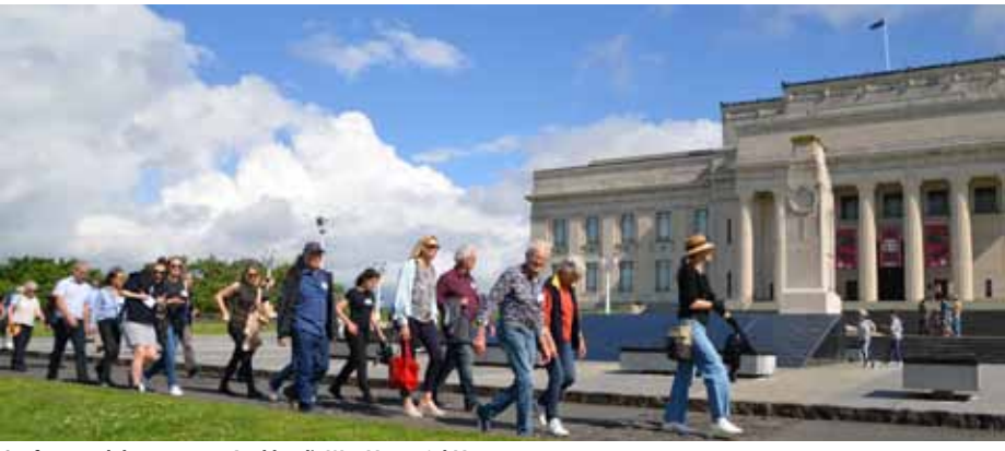
Conference delegates pass Auckland's War Memorial Museum.