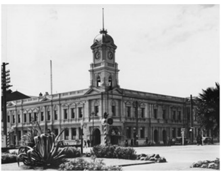
Palmerston North Post Office.