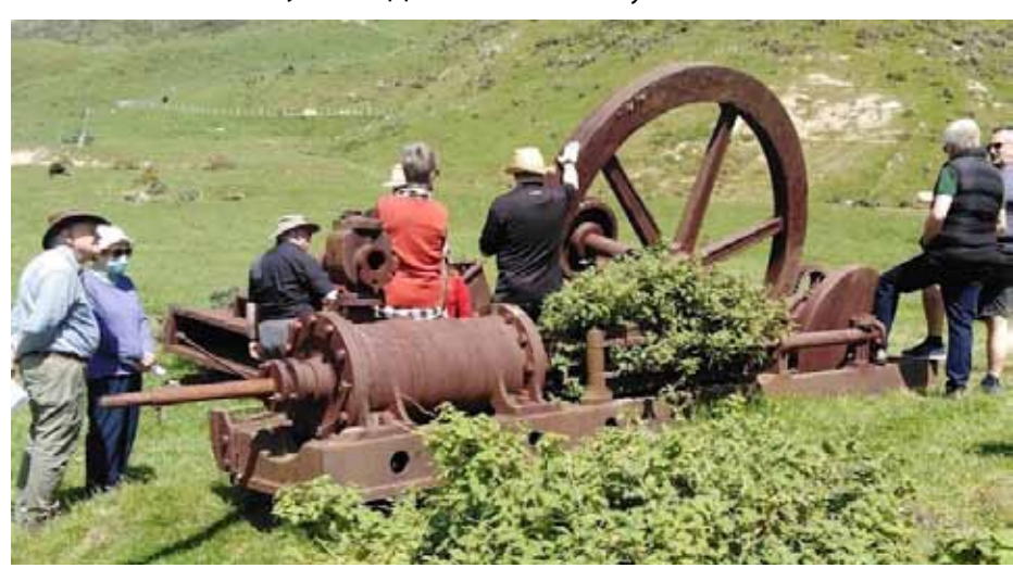
The horizontal steam engine and flywheel at the Albion Battery.