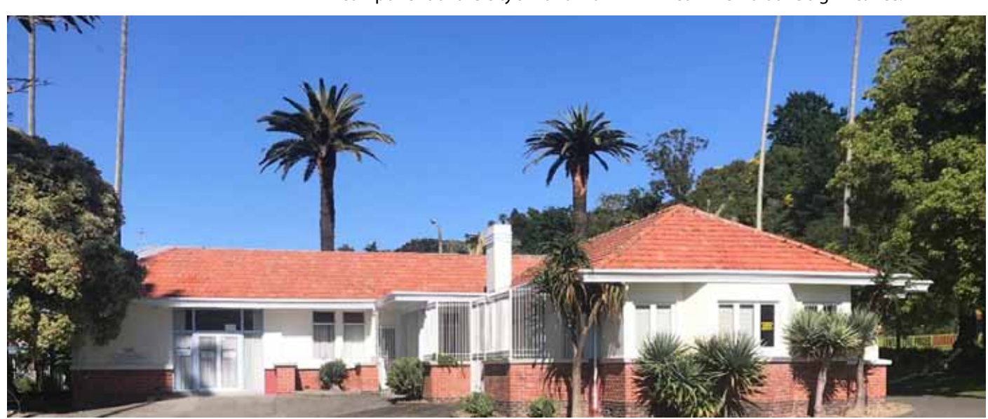
The Mothers' Rest in 2018.

The Art Deco Trust now has an MOU with Napier Council to lead the conservation work with the community and reuse the Women's Rest in ways that promote its social, cultural, historical, technological and commemorative significance.