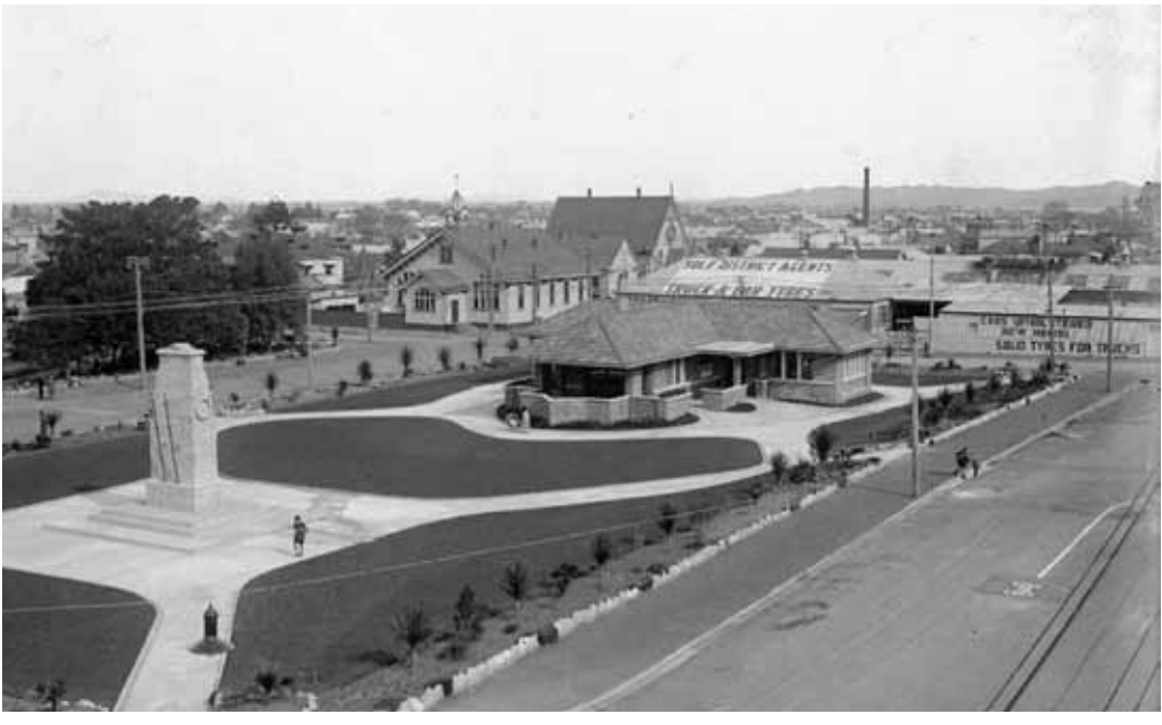
Memorial Square soon after opening c.1926 showing the cenotaph and the Women's Rest in the specially designed Memorial Square.

made. The outpourings of emotion were expressed in the enormous amounts of money donated towards memorials. Considerable controversy surrounded what sort of memorial should be built.