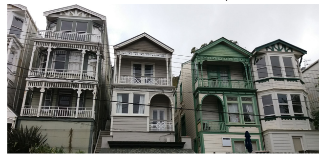
Tinakori Road, Wellington.