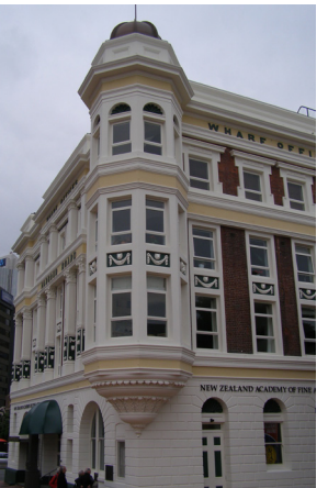
Wharf Office Building, Wellington.

Local groups initiate most advocacy for historic places in their areas. Under the Resource Management Act, local authorities must recognise and protect community heritage, and listen to the voice representing heritage in their local community.