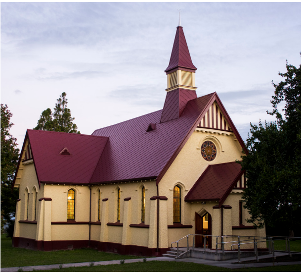
Toko Toru Tapu Church, Manutuke, Gisborne.

Historic Places Aotearoa (HPA) comprises independent organisations that work collaboratively to save and restore our heritage, and to share expertise and great ideas.