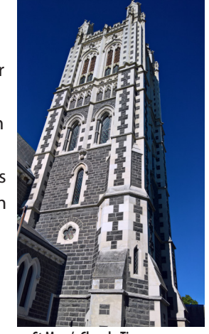
St Mary's Church, Timaru.